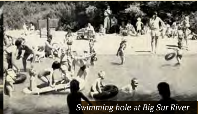
Swimming hole at Big Sur River