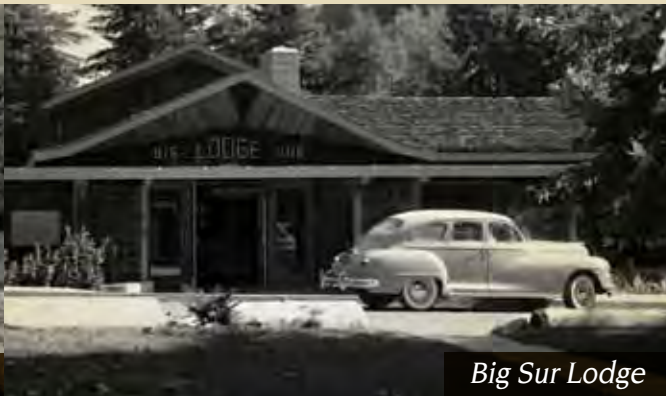
Big Sur Lodge