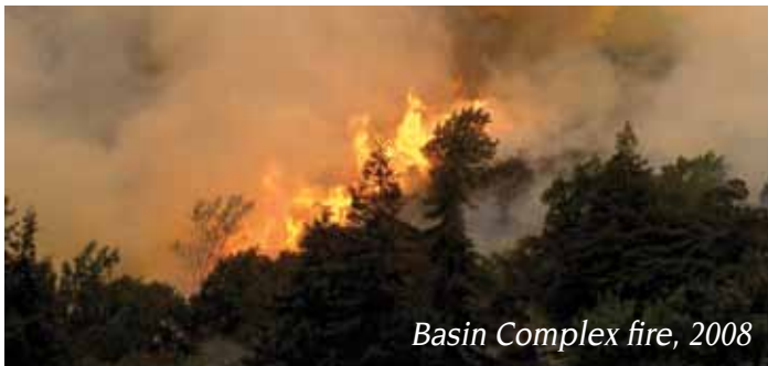
Basin Complex fire, 2008